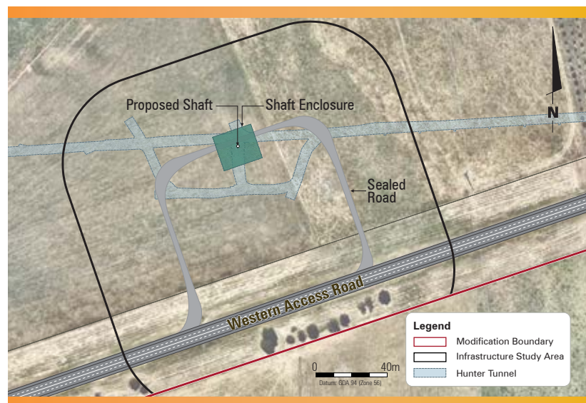
Figure 2 Conceptual Layout of New Shaft Site